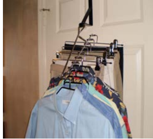
2. "On the Door" loaded with mixed Wardrobe