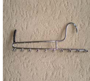
3. "On the Bar" Device

The 'On the Door" and "On the Bar" models are nearly identical. Both hang and display 10 clothing items. For both systems, hangers are always inserted from the right sides. Note also that the right sides of all tubes are funnel shape making inserting hangers easier. In addition, tubes on the devices have a slight tilt, keeping insert hangers from sliding out.