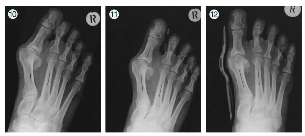
Fig. 10–12: 58 year old patient with a hallux valgus angle of 46° (10), correction with the rigid night splint to 30° (11) and with the BunionAid™ orthosis to 16° (12).