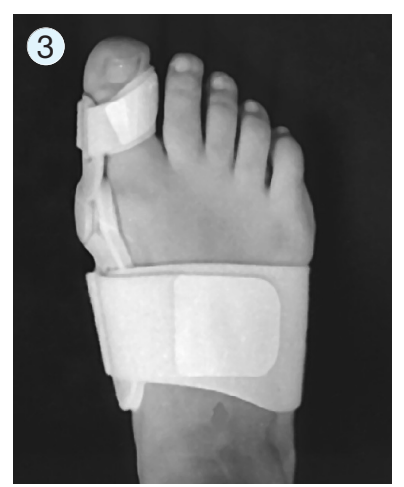
Fig. 1–3: 23 year old patient with light hallux valgus and painful bursitis (1), correction in a night splint (2) and with new dynamic orthosis (3)