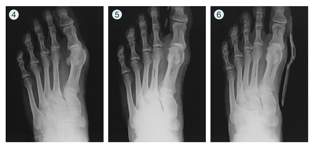
Fig. 4–6: 39 year old patient with a hallux valgus angle of 40°, correction with a rigid night splint to 20° (5) and to 18° with the dynamic orthosis (6). Normalization of the metatarsal angle (β) to 8°.