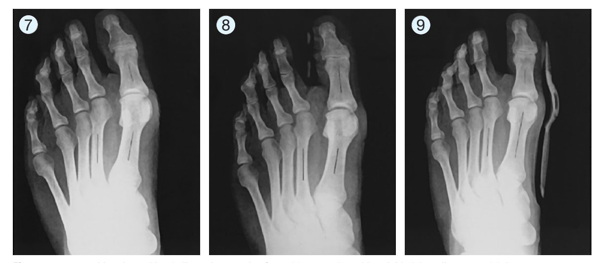
Fig. 7–9: 57 year old patient with a hallux valgus angle of 30° (7), correction with a rigid night splint to 22° (8), however, no correction of the metatarsal angle ( \beta = 14^{\circ} ). With the dynamic orthosis correction of the hallux valgus angle to physiological 12° and the intermetatarsal angle to 10° (9).